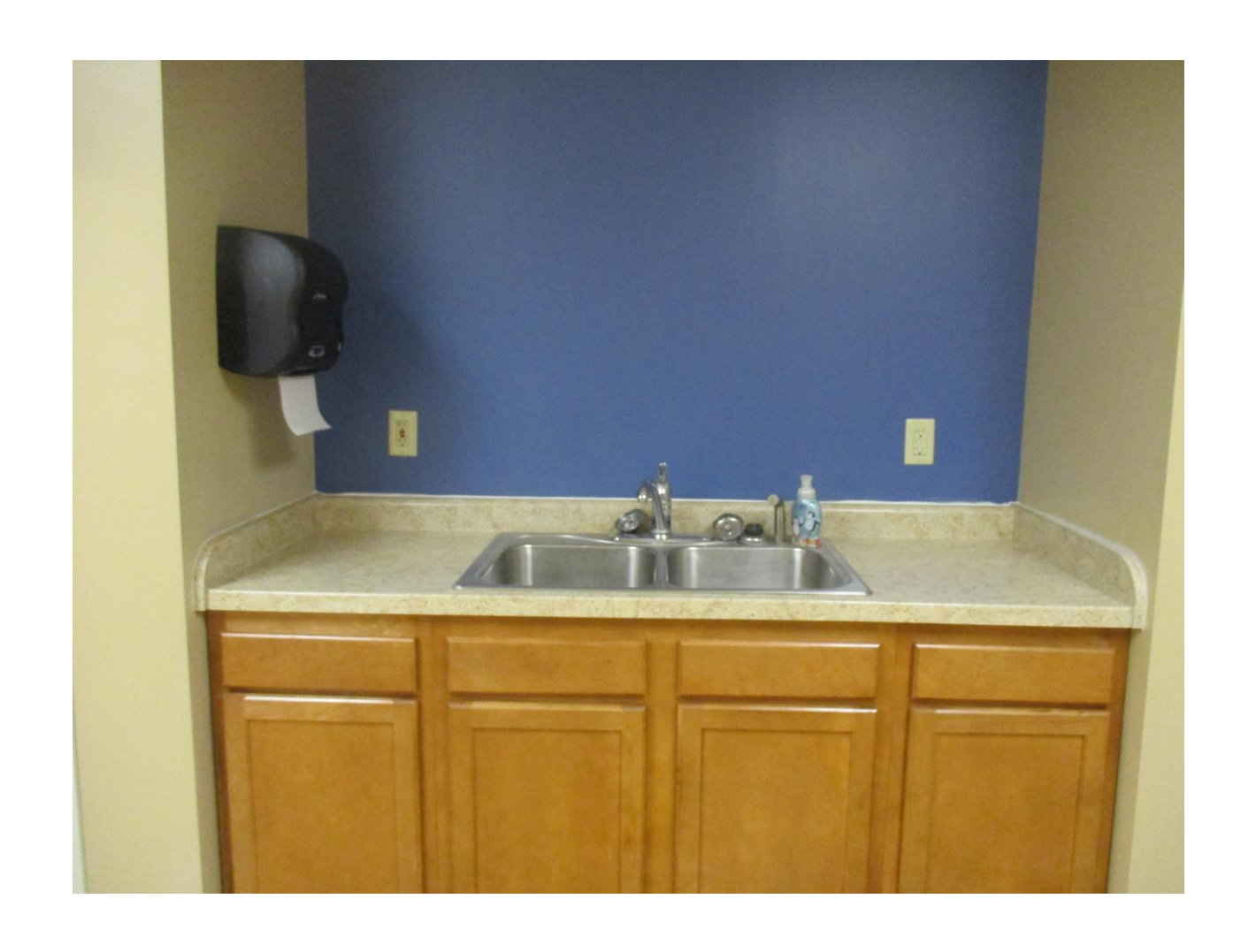
I will wash my hands at school.