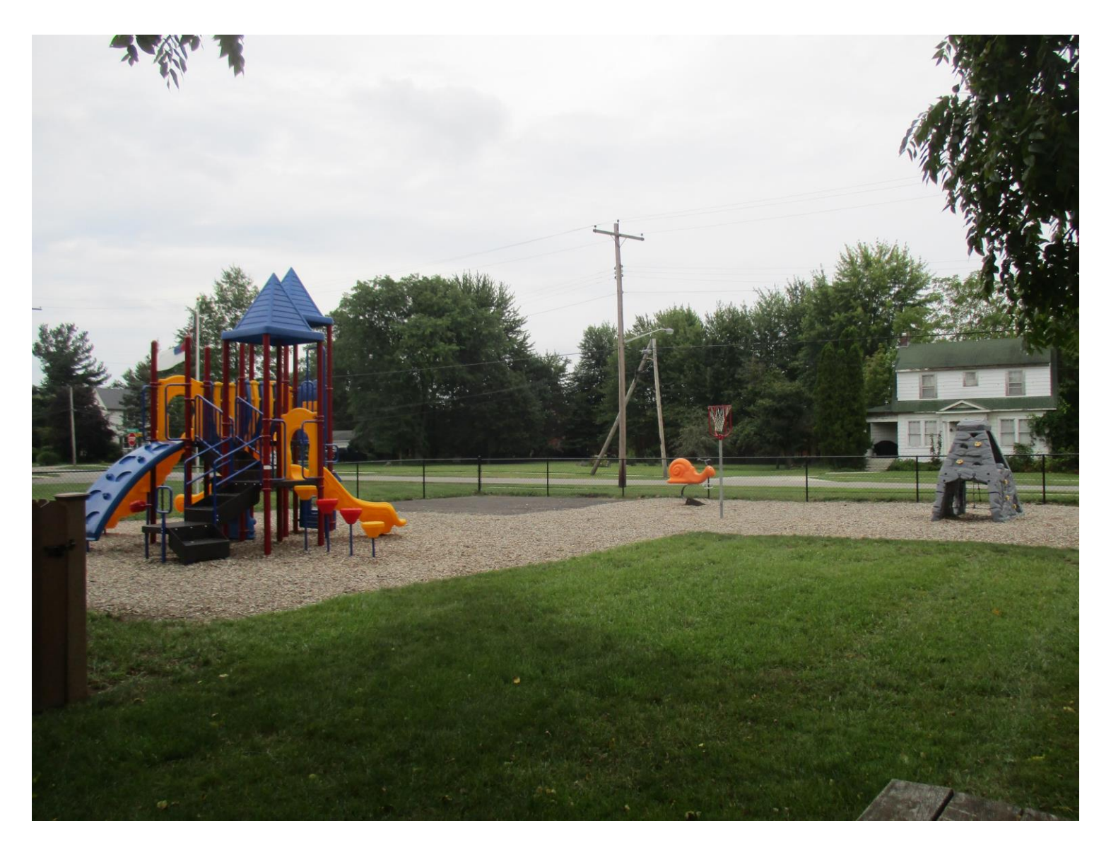
I will play on the playground at school.