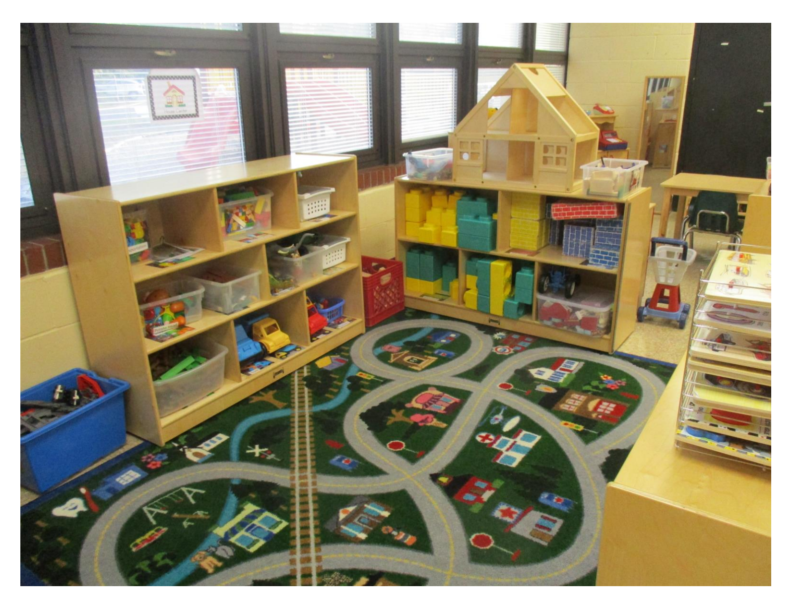
I will play with toys at school.