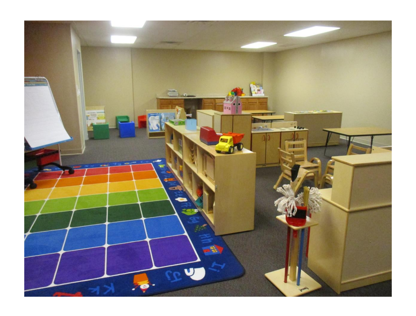
This is what my classroom might look like.